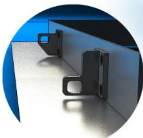
Double locking points for increased security