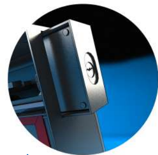
Sabotage protected padlock class 3