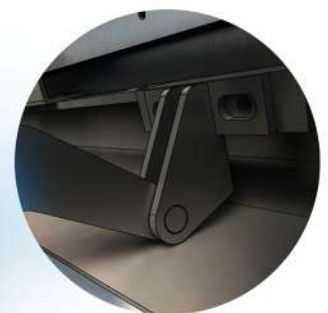
Hinges that are hidden and protected from burglary